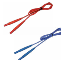
Test lead 1.2 m (banana plugs) red / blue