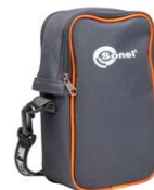
M13 carrying case